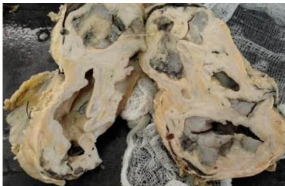
Fig. 2: “Contracted Kidney” with cystic degeneration filled with mucoid and showing orange-streaks-Xanthomatous reaction