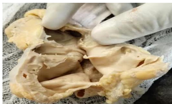
Fig. 1: Shrunken flabby kidney with distorted Cortico-medullary junction and cystic changes