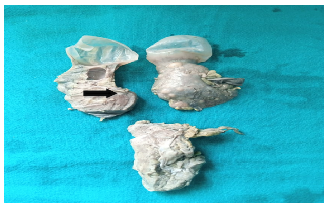
Fig. 1: Gross specimen of Left Kidney (black arrow) cut surface showing multiple yellowish nodules with a large cyst at upper pole. Piece of right kidney was grossly unremarkable.

Hematoxylin and eosin stained microsections from left kidney cyst show flattened lining epithelium along with fibrocollagenous tissue. Surrounding renal parenchyma show foci of interstitial chronic inflammatory infiltrate with focal tubular atrophy. Microsections from yellowish nodules revealed features of papillae lined by cuboidal cells having scant to moderate amount of eosinophilic cytoplasm with round nuclei showing mild pleomorphism and occasional mitotic figures per high power field along with numerous psammoma bodies (Figure 2a-d). Histological features were suggestive of papillary renal cell carcinoma. Von-Kossa stain was positive in psammoma bodies. Similarly, microsections from piece of right kidney showed foci of papillary renal cell carcinoma along with chronic interstitial inflammation and congestion. Other special stain like periodic acid schiff was negative. Immunohistochemical