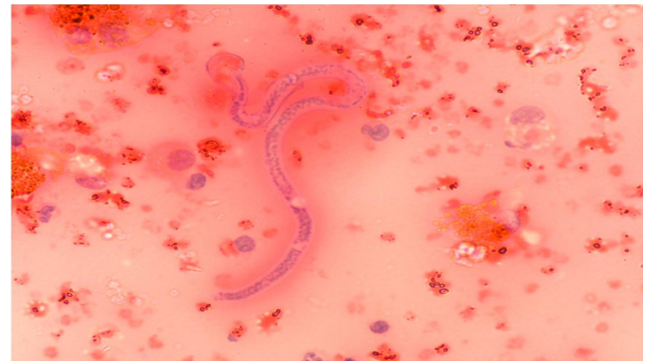
Fig. 2: Smear shows multiple microfilarial parasites admixed with eosinophils, polymorphs and necrotic debris. Haematoxylin and Eosin x 40X.

Lymphatic filariasis is a public health problem and is considered eradicable or potentially eradicable disease by international task force for disease eradication. 5 Diagnosis in patients presenting with typical clinical presentation is often easy. But majority of the affected cases remain asymptomatic and continue to transmit the disease. Therefore, microfilariae even in asymptomatic cases can reach tissue spaces due to vascular or lymphatic obstruction,