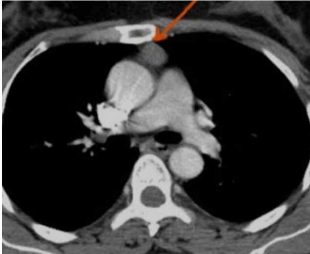
Figure 1: Thoracic CT showing anterior mediastinal mass.

Written informed consent was obtained from the patient for the publication of the case report and accompanying images.