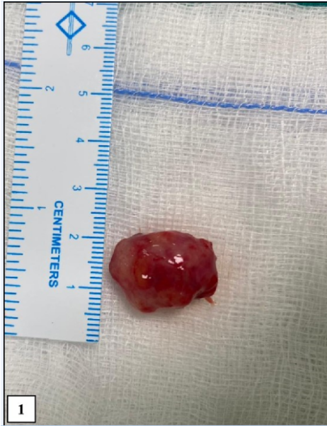
Fig. 1: Gross specimen showing single nodular soft tissue piece.

follow since then and has reported no recurrence till date.