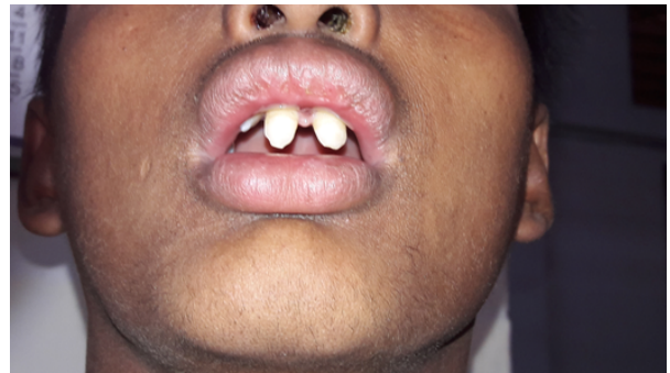
Fig. 2: Picture showing hypodontia

Ectodermal dysplasia is a group of signs and symptoms all derived from abnormalities of the ectodermal layer. More than 150 different types have been identified till date. 2