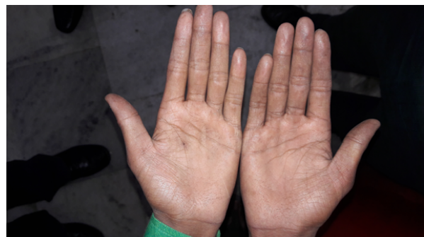
Fig. 5: Palms showing hyperhidrosis and mild keratoderma