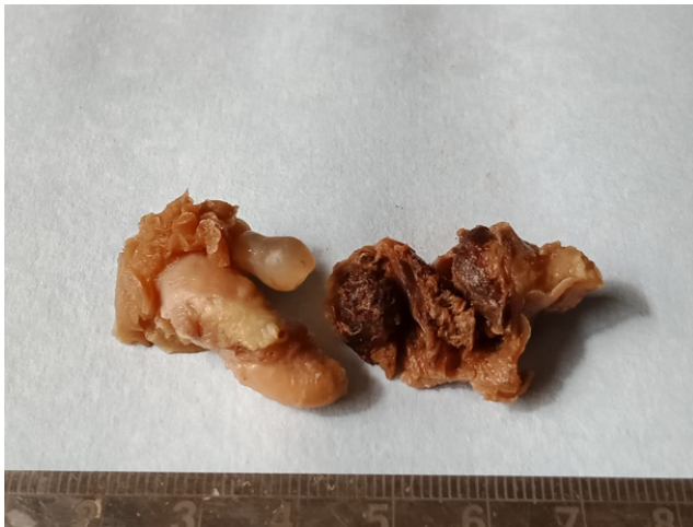
Fig. 1: On gross examination of specimen a brown black colour mass was found with in the ruptured fallopian tube.