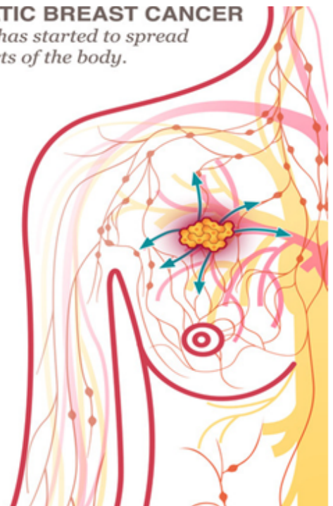
Fig. 1: Sentinel Lymph Node Metastazise

The cancer has started to spread to other parts of the body.